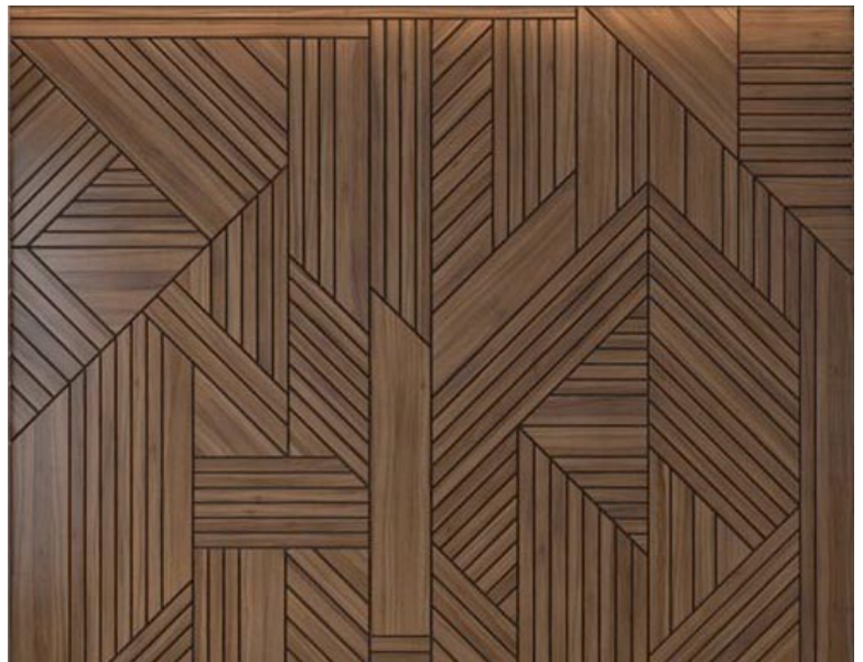
Above: Rift European Oak, custom stain, blackend lines with more intense patterning, no actual panel match.