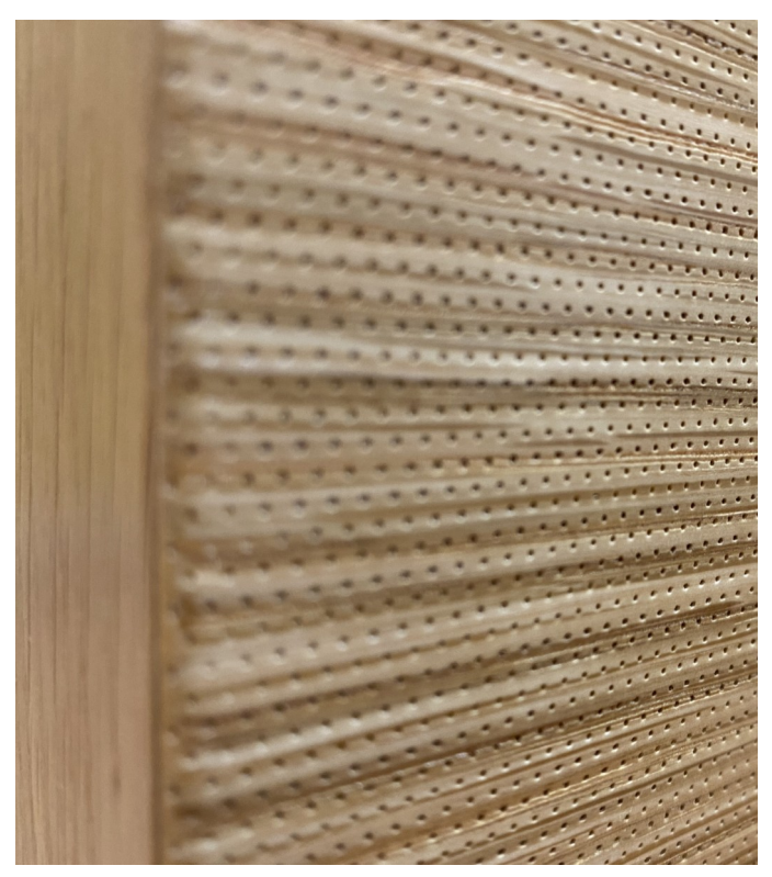
As shown in Rift White Oak - Pianissimo™ Door

Available in different thicknesses and sizes based upon project specific needs. Completely manufactured to size.