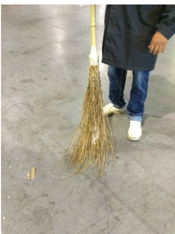
Broom Used in the factory