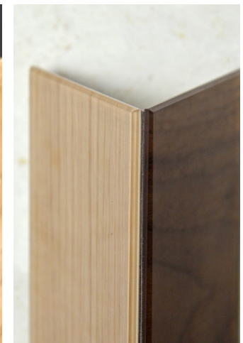
Inside Room - Outside Room

Corporate Offices: 6 Woodfield Road · Green Township · NJ 07821